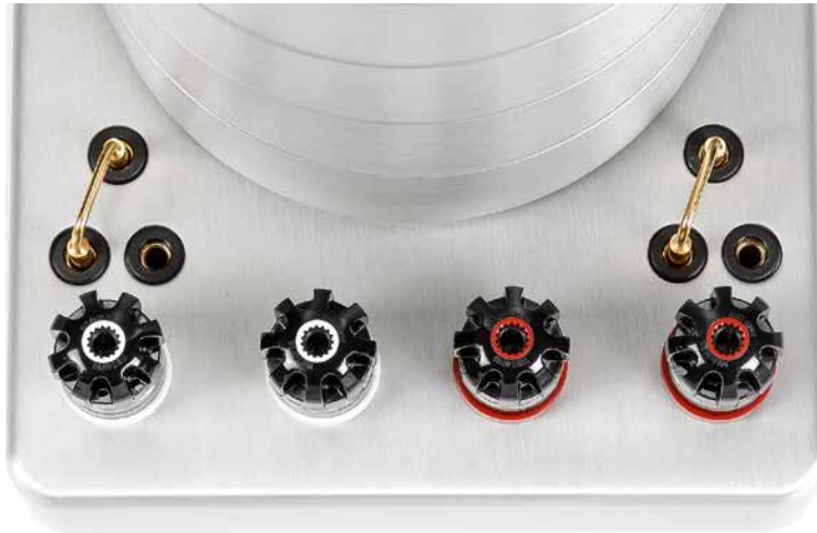
Noble WBT sockets and terminals for bass and treble adjustment.